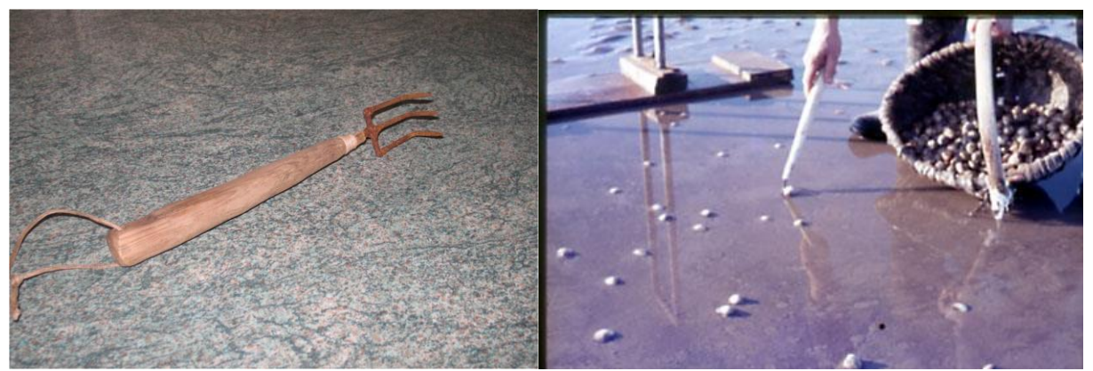
Fig 2 A. typical cram, length about 40cm; B. Cram and basket fishing for cockles. Note jumbo behind.

Mandy Knott Senior Scientist. 25<sup>th</sup> February 2016