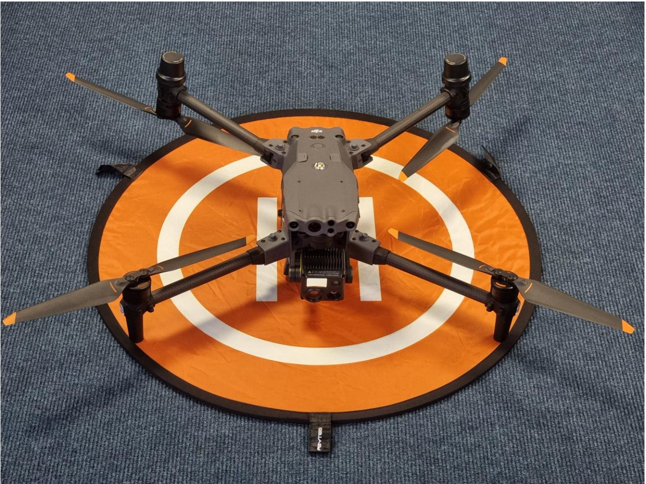
Enforcement Drone DJI Matrice M30T