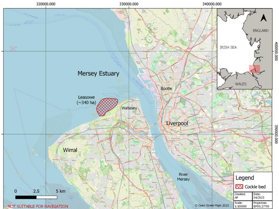
Figure 3. Surveyed and inspected cockle beds along the Wirral coast from 22 nd of June and the 21 st of September 2023