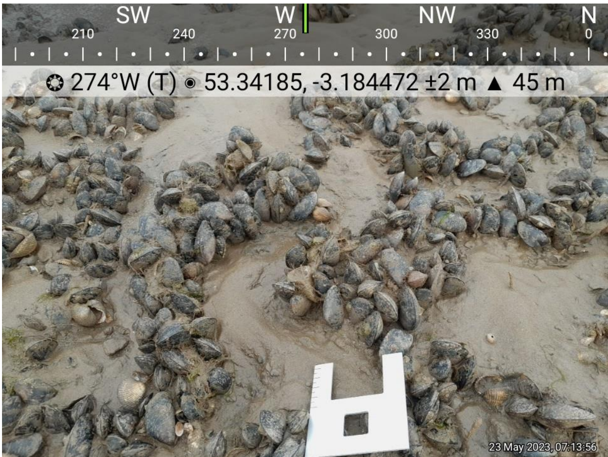
Figure 5: Mussel patch Thurstaston 23-05-23.