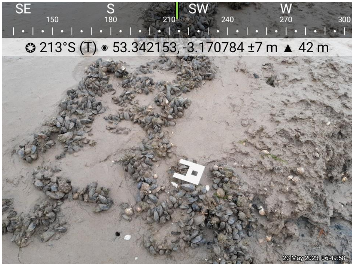
Figure 3. Mussel on Thurstaston bed 23-05-23.