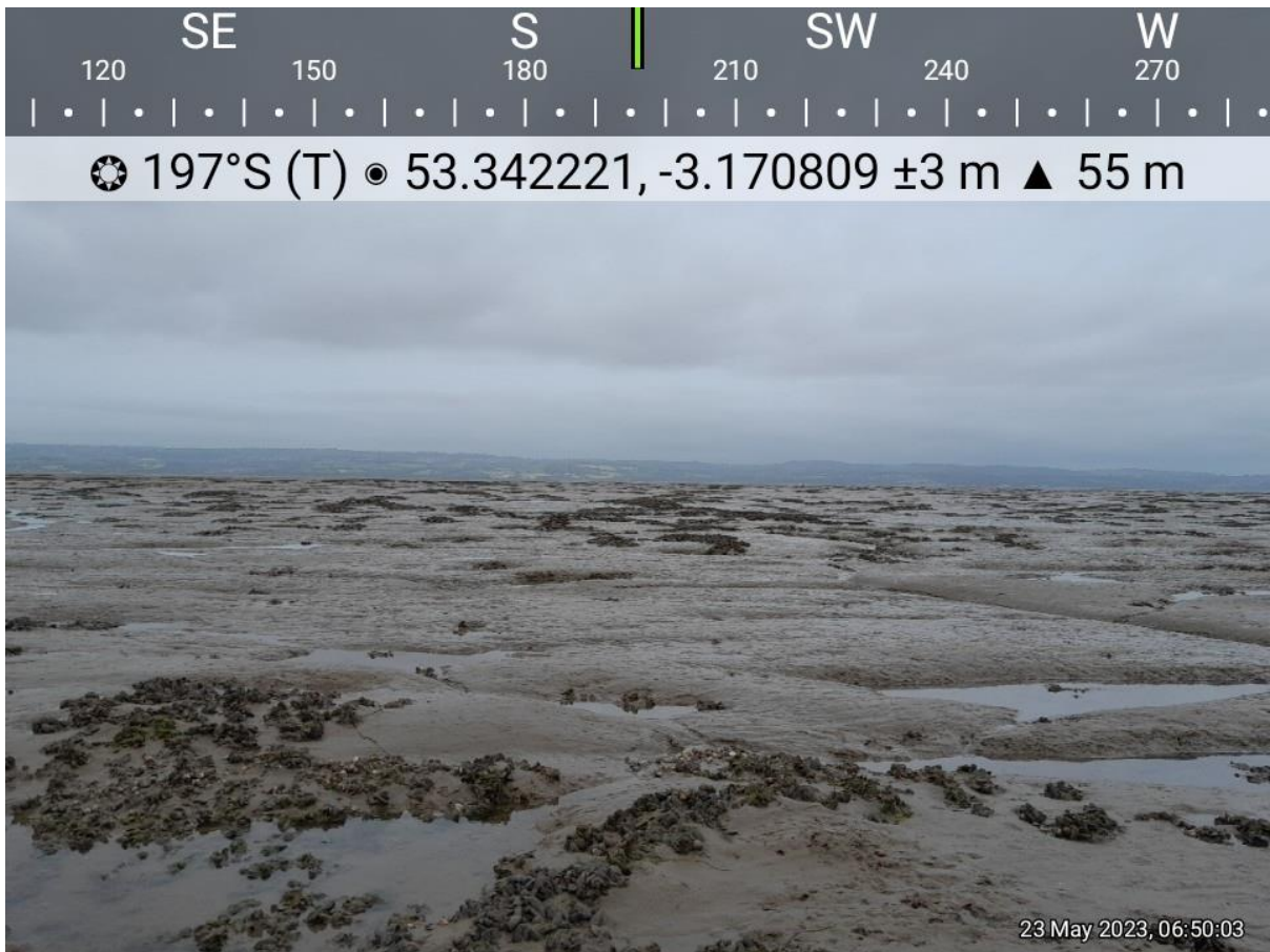
Figure 4: Thurstaston Mussel Bed 23-05-23.