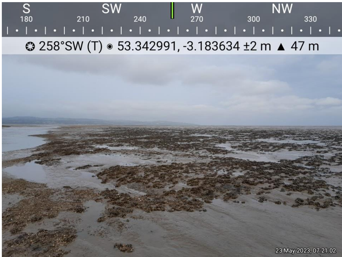
Figure 6: Mussel on other side of channel at Thurstaston 23-05-23.